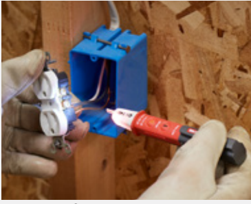
Test wires for AC voltage