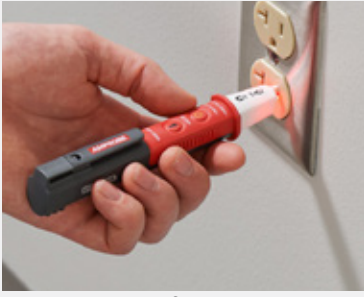
Test wall sockets for AC voltage