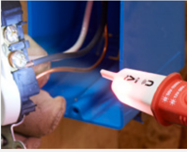
Built-in worklight (NCV-1030, NCV-1040)