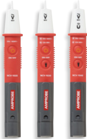
NCV-1000 Series Non-Contact Voltage Probe

The Amprobe NCV-1000 Non-Contact Voltage (NCV) tester series provides maximum safety and convenience for detecting AC voltage without interrupting electrical systems. Designed to conveniently fit in your shirt pocket, the NCV-1000 series performs in indoor and outdoor settings. Safety tested to the highest category measurement, CAT IV 1000 V, as well as IP65 water and dust resistant, the NCV-1000 series is fit for the toughest industrial applications.