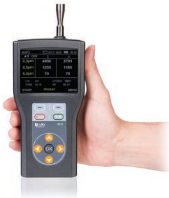
Only 1.26 lbs

The Airy Technology P311 stores 8,000 sample records that can be viewed on the unit or on a computer via USB cable. The P311 complies with ISO 21501-4 and includes a one year warranty. With excellent quality and reliable performance, the Airy Technology P311 is the best priced handheld particle counter in the market.