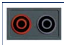
Jacks: Two standard safety banana jacks (4mm)