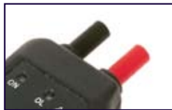
Shrouded Banana Plugs: Two 4mm safety banana plugs; standard 3/4" (19mm) spacing