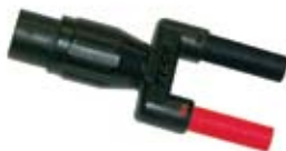
Banana (female) - BNC (male) Adaptor Catalog #2118.46 (optional)

** This model is specifically designed to be used with recorders or power analyzers with a Voltage AC input. A scale factor may need to be entered into the recorder to display the exact value.