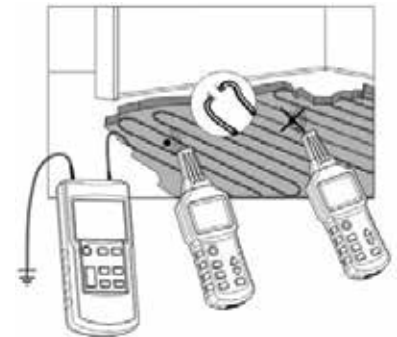
Detects breakers in radiant heating systems