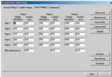
Model 5070 includes Ramp Function which allows programming of three different ramp test profiles, each containing up to five voltage steps between 40 and 5100V and time per step of up to 10 hours.