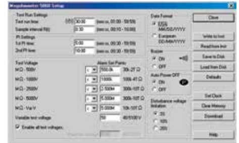
Clear and easy setup from one dialog box for Model 5060.

One button operation starts test and graphs results