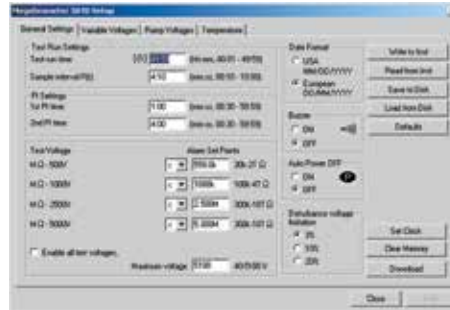
Four tabbed dialog boxes allow for clear and easy setup of all functions of the Model 5070, including setup for variable voltage and alarm set points, as well as step voltage tests and temperature compensation.