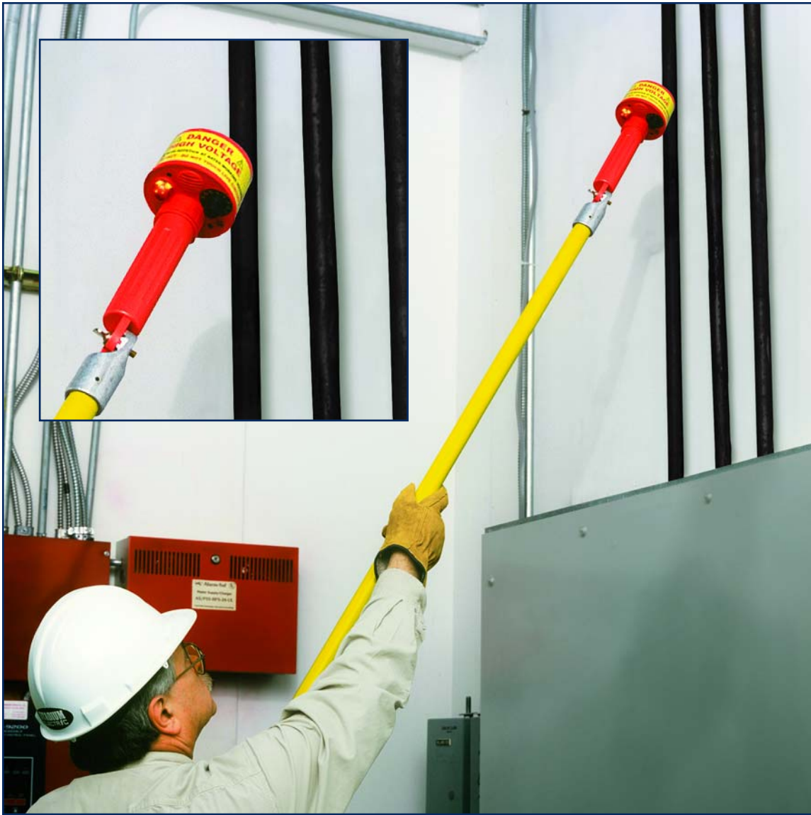
Model 275HVD checking for live voltage on main feeder