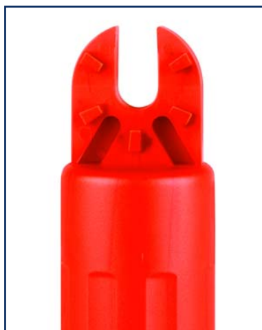
Universal spline for hot stick connection