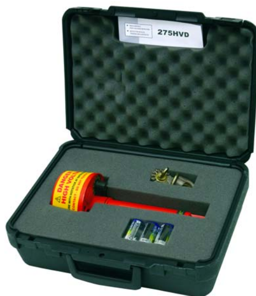
Model 275HVD includes three C cell batteries, a hard carrying case and user manual