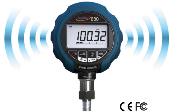
680 with data logging and wireless (optional)