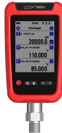
Additel 260EX with ADT158Ex module