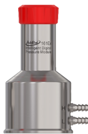
"ADT161Ex pressure modules - See ADT161 Datasheet for more info"

Note: [1] For custom RTD cable lengths over 100 feet (30 meters), which will adhere to Class B.