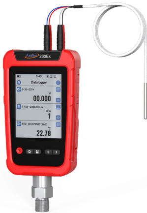
ADT260Ex with AM1602 temperature probe

Note: The ADT260Ex can be purchased without the ADT158Ex module if needed using the following part number: ADT260EX-NO