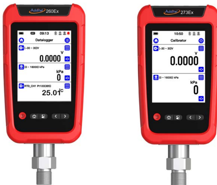
Additel 273Ex and 260Ex with ADT158 pressure module installed